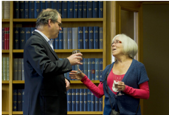
Audience members meet and greet over pre-event nibbles.

we see injustices and polarization of the media, even though we may feel like such atrocities could never happen here. Armoudian added that even though we may feel like “it can’t happen here,” so too was the feeling in places like Bosnia and Chile. Ellis emphasised that we must always pay heed if a “spiral of silence” begins, where those who feel they are not in the majority often will not speak up. He commented that even if you feel as though you are in the minority you must speak to defend the freedom and objectivity of our media.